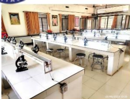
Lab with monocular microscopes

The institution has created an ecosystem for innovations including an incubation centre and other initiatives for the creation and transfer of knowledge